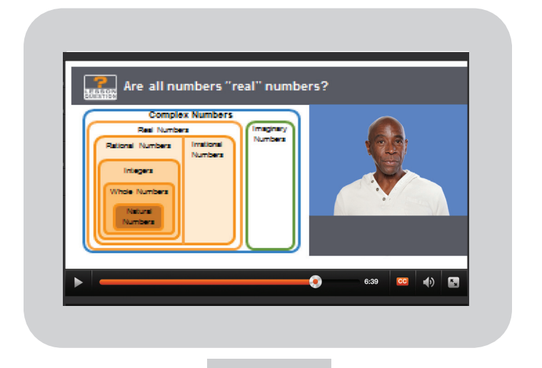
Edgenuity courses use graphic organizers to make concepts clearer.

teachers can create individualized tutoring modules by customizing targeted supplemental learning blocks. At the end of instruction, teachers can adjust the time allotted for assessments, allow students to use a calculator or dictionary, or modify grading settings.